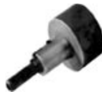
Internal skiving tool