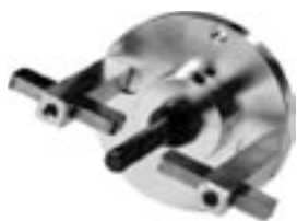
External skiving tool

External skiving tool, 3/16"-2" Internal skiving tool, 3/8"-2"