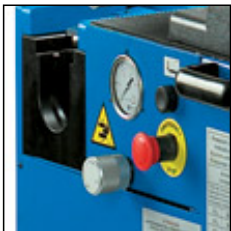
<P>DIN 2353 Rings preassembly</P>