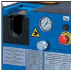
DIN2353 Rings preassembling Control board