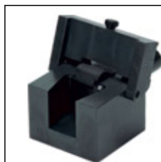
37° Flaring block